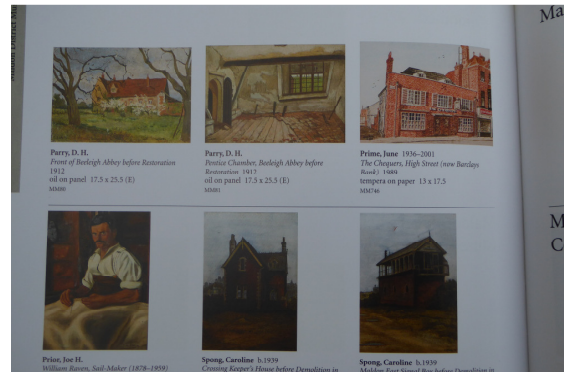
Maldon District Museum

Art UK works with the UK's public art collections to showcase their artworks to the world. The art that is put online is for enjoyment, learning and research